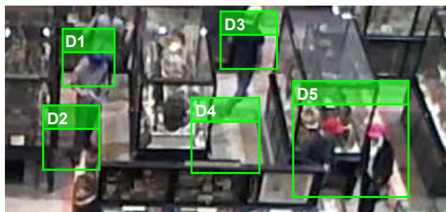
Fig. 2. The detections generated by our implementation of foreground detector.

receiving WiFi beacons from the APs periodically. The captured video stream is processed by the foreground detector to extract detections of moving objects, and then the tracker fuses the visual detections with WiFi RSSI measurements collected by the mobile devices to a) generate accurate trajectories, and b) identify the target ID of each trajectory.